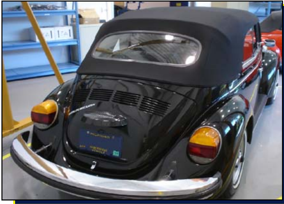
A completed 1979 Volkswagen Beetle with a canvas black color top.