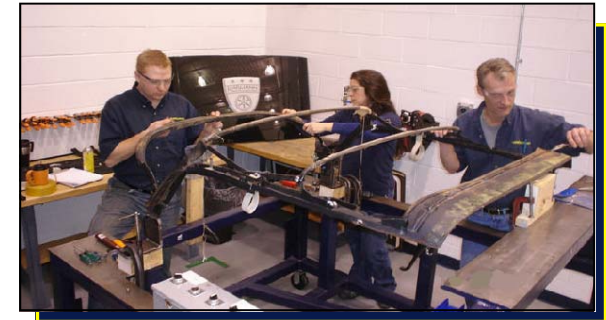
A Beetle frame is being prepped for paint before it undergoes a fitting for the canvas top.

At the end of the restoration process, you are presented with a certificate of authentication, the mark of quality restored by none other than those who built the original.