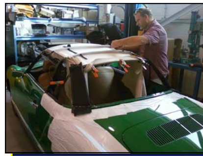
A certified technician works on the headliner and mattress pad for a 1974 Karmann Ghia.

The price of any restoration work depends on the scope of work and the condition of the convertible top and vehicle. To be able to estimate the work involved in restoring your convertible top, a good first step would be for our technicians to take a look at it.